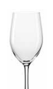
200 00 03 Classic 305 ml / 10¾ oz H: 7¾" D: 3"