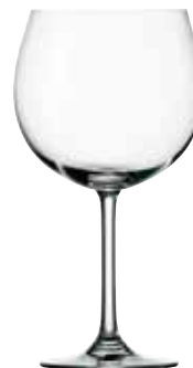
100 00 00 Weinland 650 ml / 23 oz H: 8" D: 4¼"