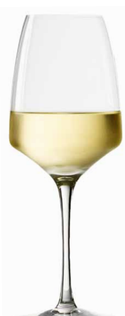
220 00 03 Experience 285 ml / 9¾ oz H: 8¼" D: 3"