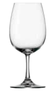
101 00 02 Weinland 350 ml / 12¼ oz H: 7" D: 3"

A tapered, gently curved bowl keeps temperatures low and aromas focused. The narrow rim directs the flow across the taste zones of the tongue with a balance of sweetness and acidity. The heightened aroma along with the simple shape matches a variety of white wines from dry and fresh to voluptuous and rich.