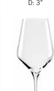
231 00 03 Quatrophil 404 ml / 14¼ oz H: 9¾" D: 3½"