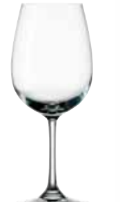
100 00 01 Weinland 450 ml / 15¾ oz H: 8" D: 3¼"