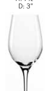
150 00 02 Universal 387 ml / 13½ oz H: 8¼" D: 3"