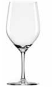
376 00 35 Ultra 552 ml / 19½ oz H: 8¼" D: 3½"