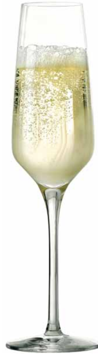
220 00 07 Experience 188 ml / 6 3/4 oz H: 8 3/4" D: 2 1/2"