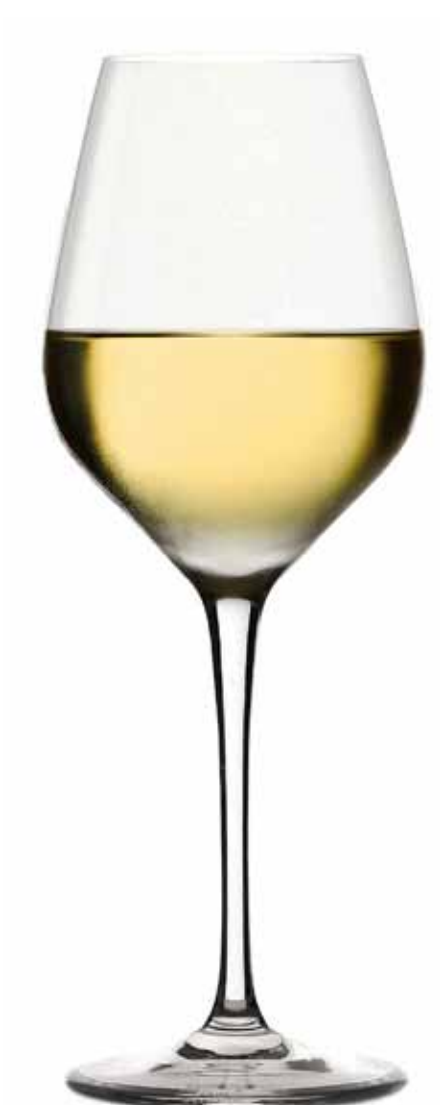
147 00 02 Exquisit 350 ml / 12¼ oz H: 8" D: 3"