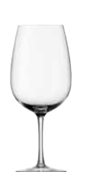
100 00 37 Weinland 660 ml / 23 oz H: 8¾" D: 3¾"