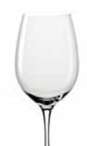
150 00 35 Universal 650 ml / 23 oz H: 9" D: 3¾"