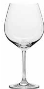
210 00 00 Grand Cuvee 750 ml / 26½ oz H: 9" D: 4¼"