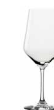
377 00 01 Revolution Power 490 ml / 17¼ oz H: 9" D: 3½"