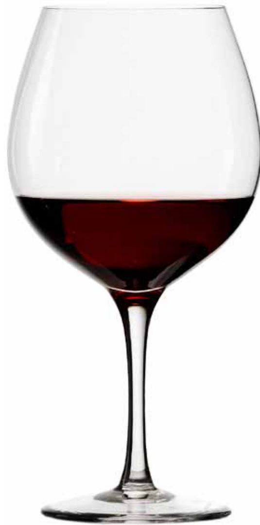
150 00 00 Universal 740 ml / 26 oz H: 8½" D: 4¼"