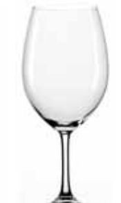
200 00 35 Classic 650 ml / 23 oz H: 8¾" D: 3¾"