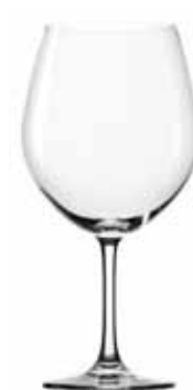
200 00 00 Classic 770 ml / 27¼ oz H: 8½" D: 4¼"