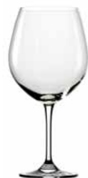
180 00 00 Event 770 ml / 27¼ oz H: 8¾" D: 4¼"