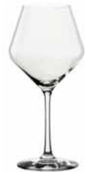
377 00 00 Revolution Mature 545 ml / 19¼ oz H: 8½" D: 4¼"

A wide rim directs the flow right over the front and center zones of the tongue, playing down the acidity and accentuating the rounder, mellower qualities of these wines.