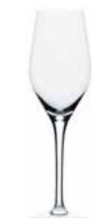
147 00 29 Exquisit 265 ml / 9 1/4 oz H: 8 3/4" D: 2 3/4"