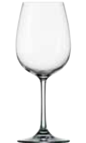
100 00 02 Weinland 350 ml / 12¼ oz H: 7¾" D: 3"