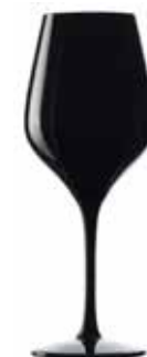
447 74 02 Exquisit Blind Tasting Glass 350 ml / 12 1/4 oz H: 8" D: 3"