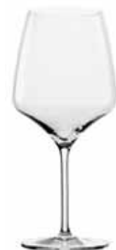
220 00 00 Experience 695 ml / 24½ oz H: 9" D: 4"