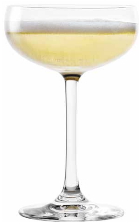
273 00 08 Saucer 230 ml / 8 oz H: 5 3/4" D: 3 3/4"