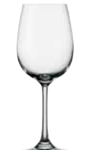
100 00 03 Weinland 290 ml / 10¼ oz H: 7½" D: 3"

These glasses are appropriate for light-bodied red wines and rosés as well.