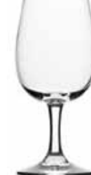
200 00 31 Classic Tasting Glass 220 ml / 7 3/4 oz H: 6" D: 2 1/2"