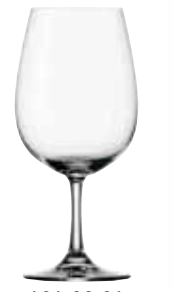
101 00 01 Weinland 450 ml / 15¾ oz H: 7¼" D: 3¼"

A large bowl and narrowed rim are necessary to aerate and concentrate aromas towards the nose while directing a balanced flow over the taste zones of the tongue. These glasses are also well-suited to a wide array of red wines as well as full-bodied white wines.