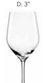
376 00 02 Ultra 376 ml / 13¼ oz H: 7½" D: 3"