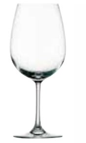
100 00 35 Weinland 540 ml / 19 oz H: 8¼" D: 3½"

The large bowl allows the bouquet to develop layers of aroma. The narrow opening concentrates the aromas towards the nose. The thin rim directs the wine towards the front of the tongue. This allows the concentrated flavors to dominate before the tannins are directed towards the back of the tongue.