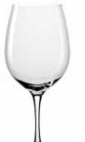
180 00 35 Event 640 ml / 22½ oz H: 9" D: 3¾"