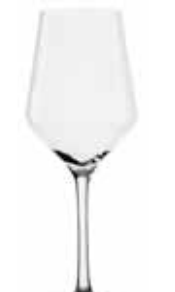
377 00 02 Revolution 365 ml / 13 oz H: 8½" D: 3¼"