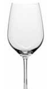
210 00 01 Grand Cuvee 495 ml / 17½ oz H: 9" D: 3½"