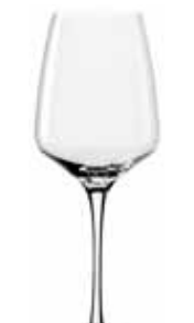
220 00 02 Experience 350 ml / 12¼ oz H: 8½" D: 3¼"