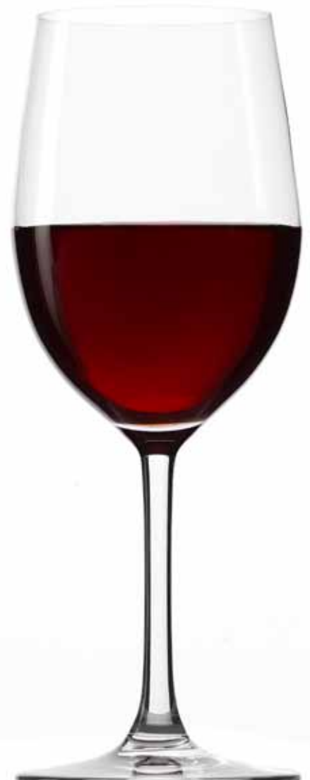
200 00 01 Classic 448 ml / 15¾ oz H: 8¾" D: 3¼"