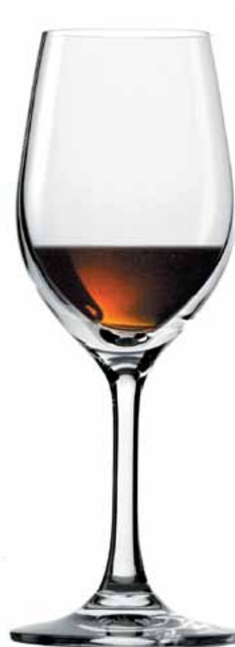
200 00 04 Classic Port 180 ml / 6 1/4 oz H: 6 3/4" D: 2 1/2"